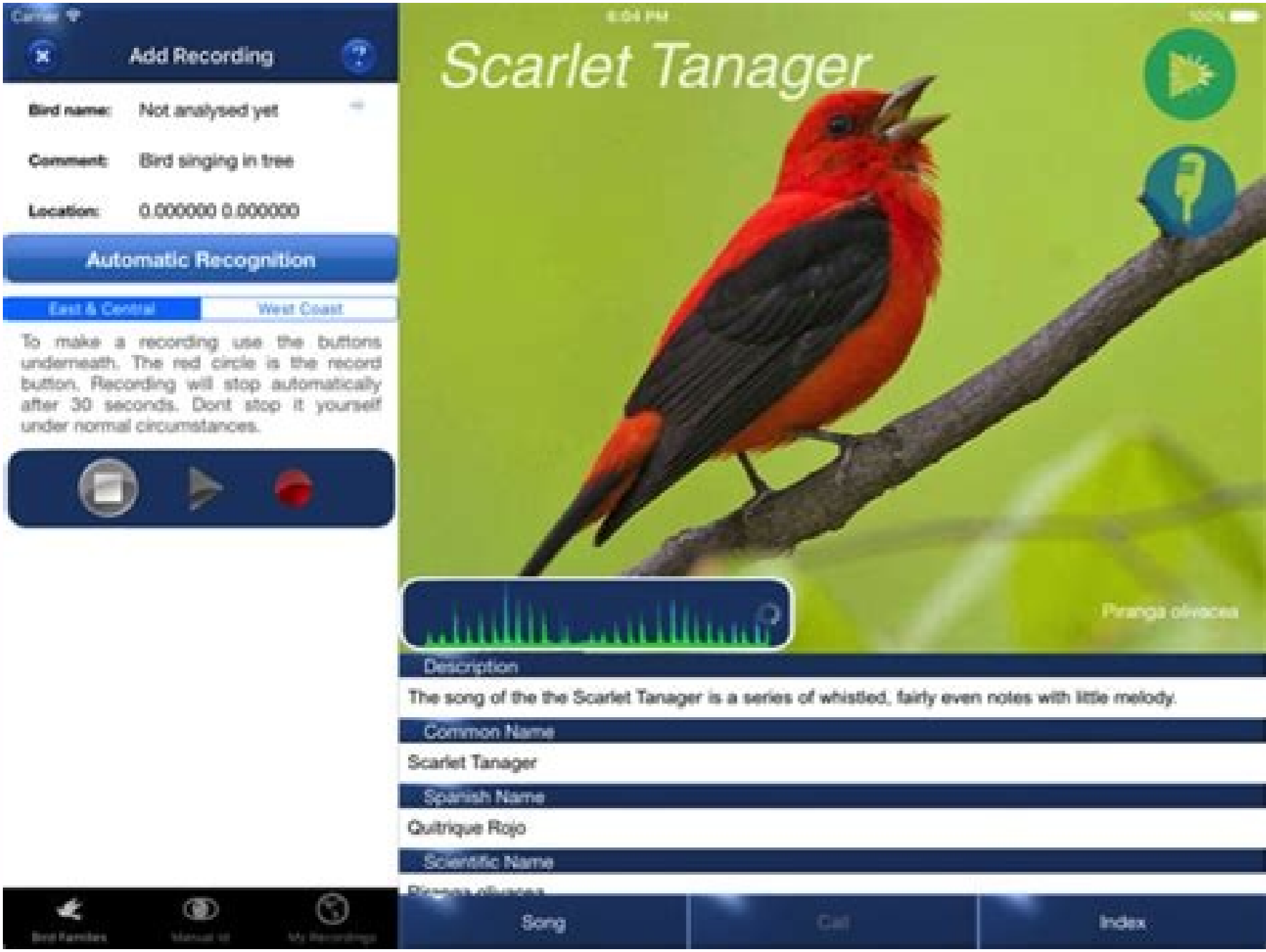
Android bird song recognition app. What is the best app for song recognition.