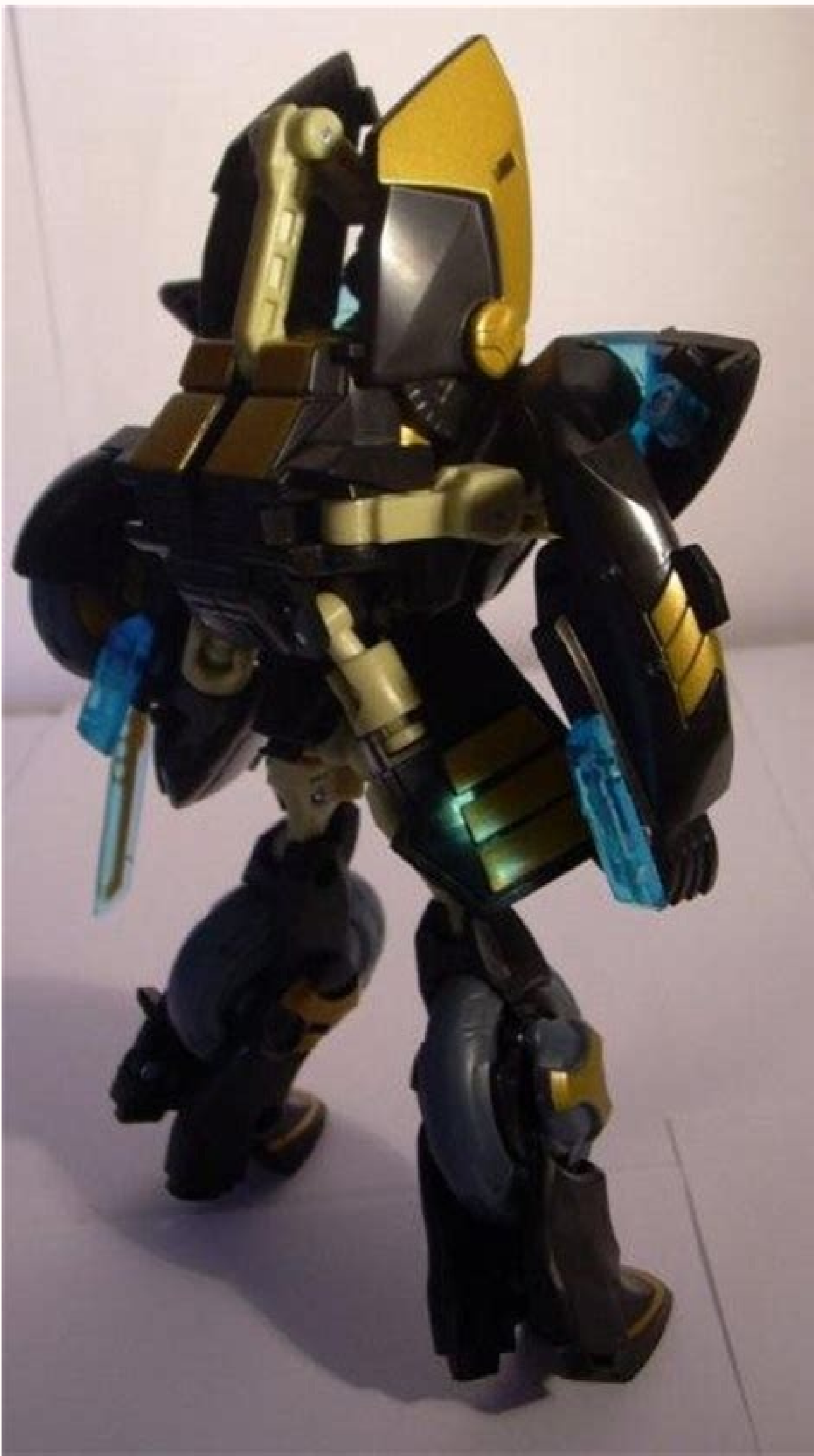
Transformers animated samurai prowl toy