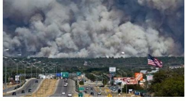
Canyon point weather. Weather report canyon lake texas. Marble canyon weather.